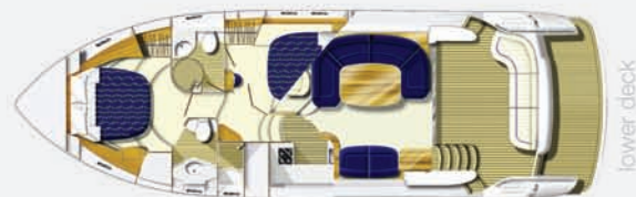
lower deck option 2